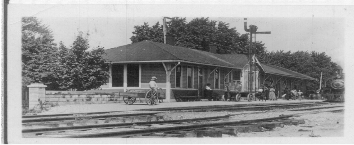
Hawesville Railroad Station – Now the Hancock County Museum